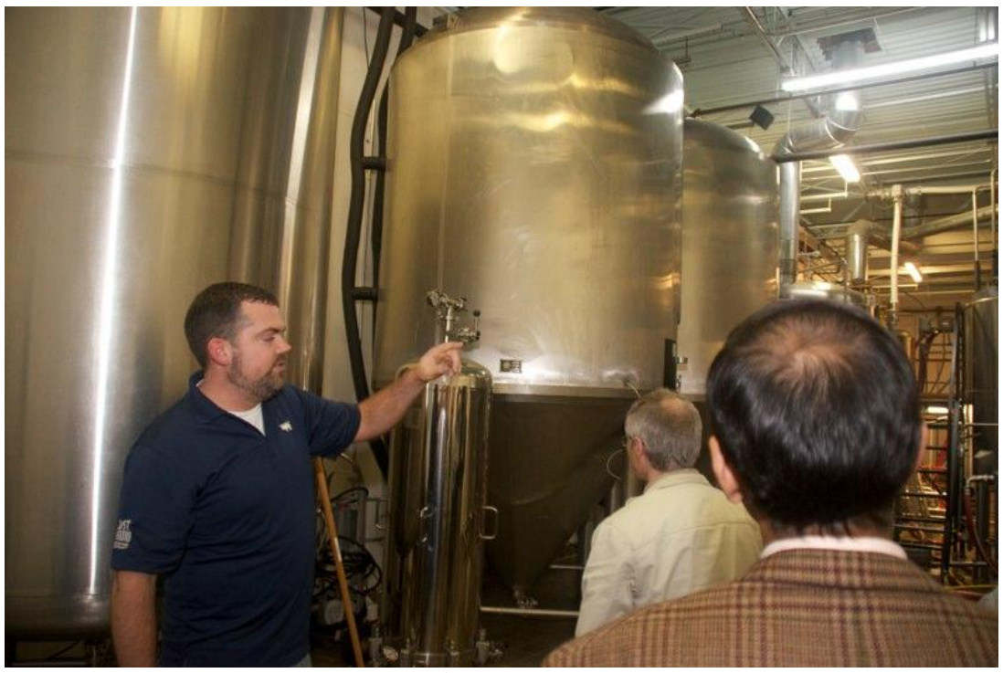
Lost Rhino Brewery Tour

Also check out the <u>Photo Gallery</u> on our website for pictures from our meetings at the Amphora and this past year's "field trips" to Micron Technology, Sunset Hills Vineyard, and the Lost Rhino Brewery!